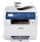
print | copy | scan

Call today. For more information, call 1-877-362-6567 or visit us at www.xerox.com/office