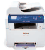
print | copy | scan | fax